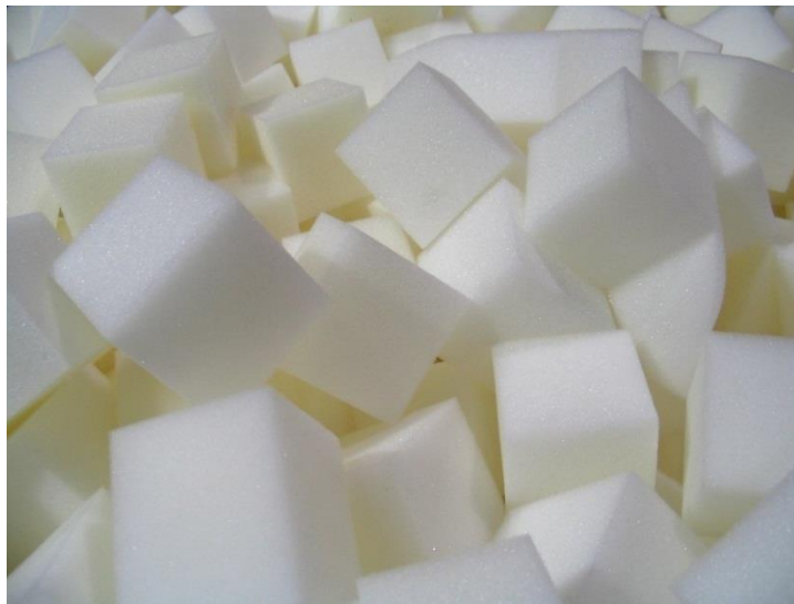
Figure 1. Waterloo Biofilter foam filter media

The Waterloo Biofilter is an attached growth biological trickling filter. Sanitary wastewater from the residence is collected in the pre-treatment tank where the sewage settles and anaerobic bacteria begin the treatment process. Pre-treatment tank effluent is pumped to the Waterloo Biofilter treatment unit. The absorbent foam filter medium within the treatment unit creates an ideal environment for microbial growth and attachment. Beneficial bacteria colonize the interior surfaces of the filter medium where they are protected from predators, desiccation, and freezing. These microbes degrade and oxidize organic pollutants, coliform bacteria, ammonium, and other contaminants as the wastewater is retained in the filter medium by capillarity. Air passively circulates throughout the filter media providing an aerobic treatment environment without the need for forced aeration. The Waterloo Biofilter provides both physical filtration and biological treatment of wastewater in one step – ensuring high levels of pollutants are removed before water is returned to the natural environment.