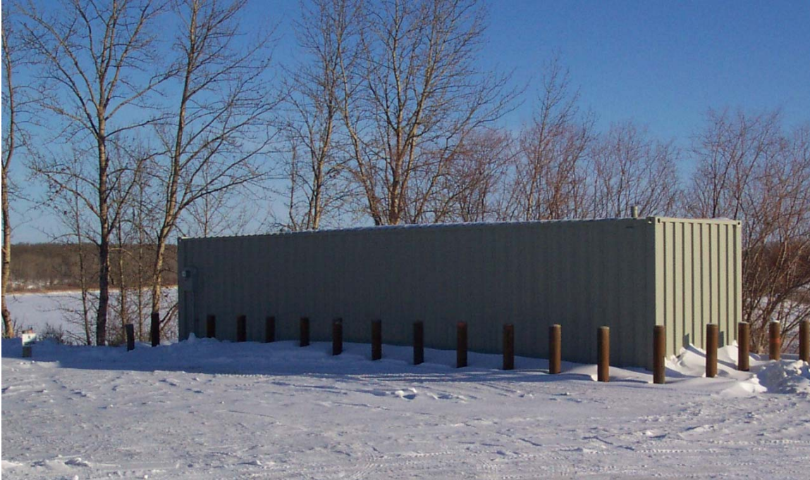
Figure 3. SC-40 installation at St. Louis, northern Saskatchewan, which operated successfully down to -49^{\circ}\text{C} .