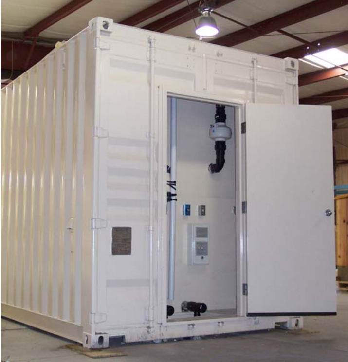
Figure 2. SC-40 being assembled in the plant, showing control room through access door, with drains, forcemain, space heater, and ventilation fans.

Figure 3 shows one of a dozen SC-40s now in operation, with this one placed on a 'sono-tube' foundation on the banks of the South Saskatchewan River in north-central Saskatchewan. The unit is treating sewage from the village of St. Louis prior to surface discharge. Despite -49^{\circ}\text{C} temperatures this past winter, and influent sewage temperatures of only 2-3^{\circ}\text{C} , the unit operated without problem for cBOD and TSS, the parameters of interest. Besides villages, other SC-40s are treating campgrounds, trailer parks, golf courses, and truck stops.